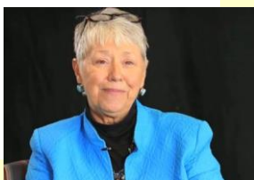
Preparing for NCAPPS Second Annual Conference