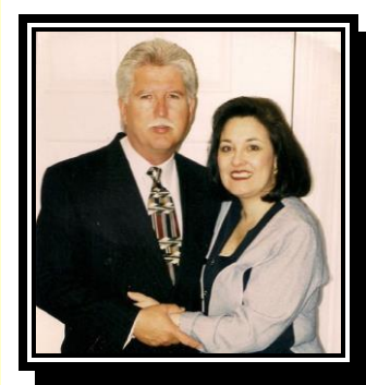
CIVIL PROCESS SERVICE OF NORTH CAROLINA, LLC